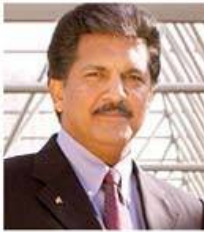
Mr. Anand Mahindra Chairman – Advisory Committee Vice Chairman & Managing Director – Mahindra & Mahindra