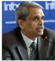
Mr. S. (Kris) Gopalkrishnan Member – Advisory Committee Co-Chairman – Infosys Limited